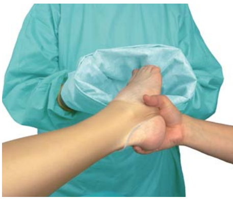
01 Start draping with table cover, then drape the leg with stockinet.