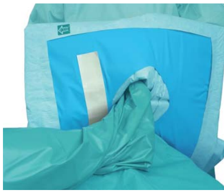
02 Position leg through aperture, adhesive strip underneath the drape gives extra security.