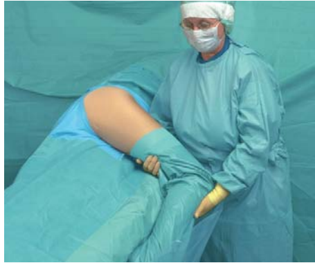
05 Integrated in the drape are large leg positioning pouches.