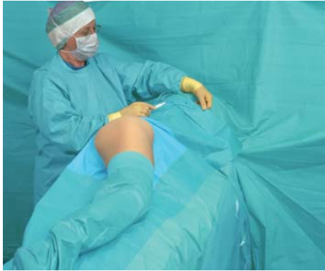
04 Unfold the drape over anaesthesia frame.