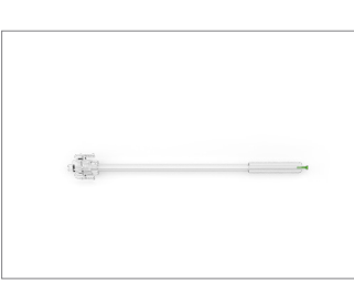
Coaxial Canal Brush Tip